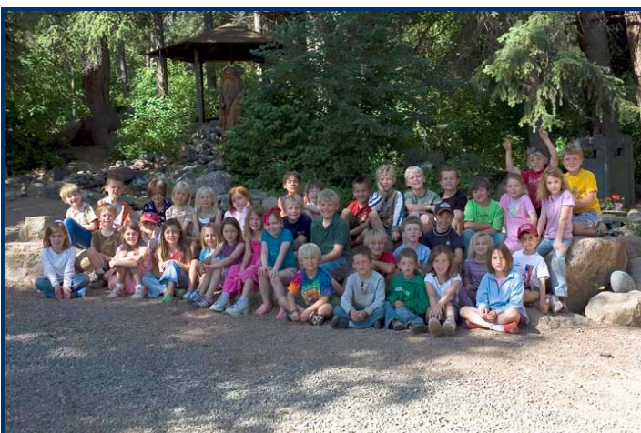
These GG Alum Progeny will soon wind up in a photo just like this—33 of our Myths and Magic campers belonged to former Geneva Glen alums!